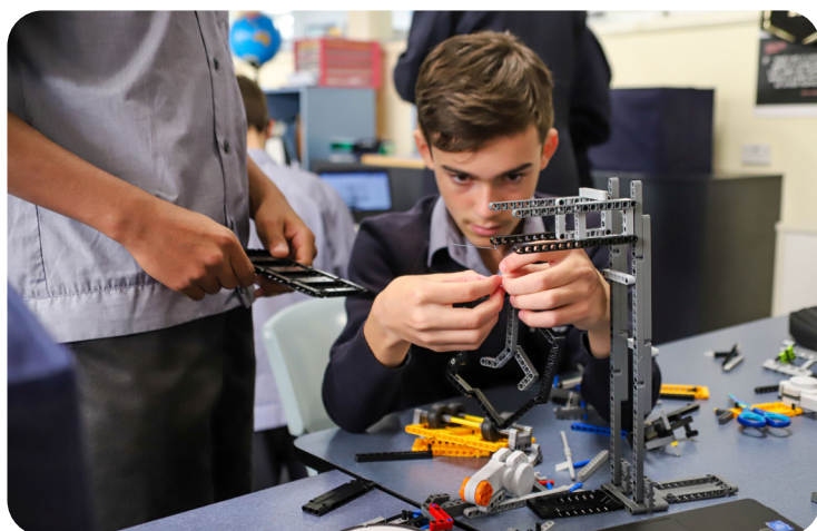
Challenge 1 – Impossible structure