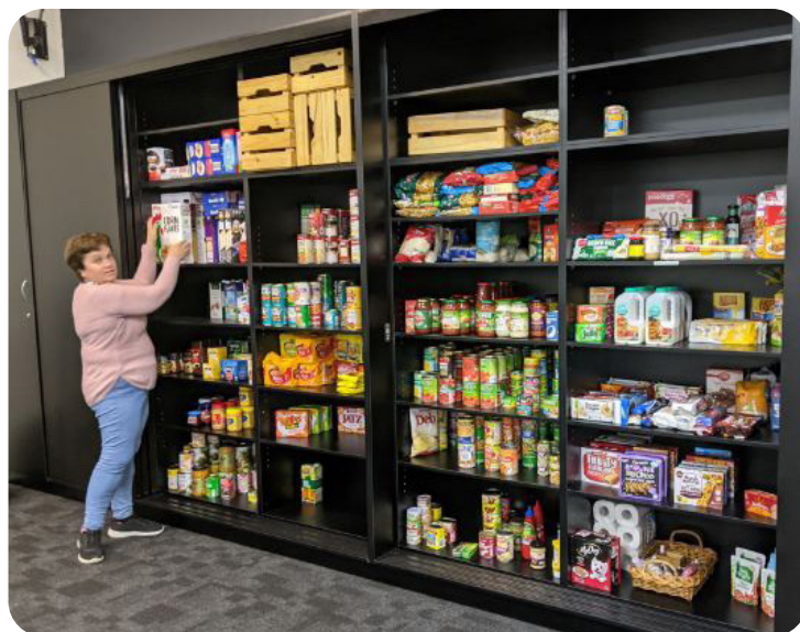
Social Justice Team of 2021