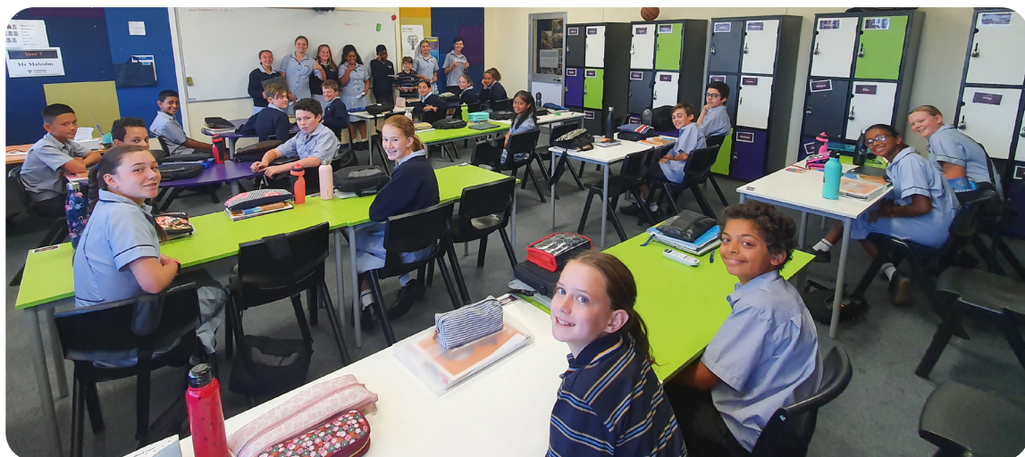
Andrew Malcolm Middle School Teacher