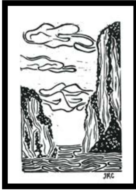
Halong Bay Print